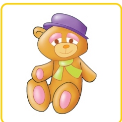
one teddy bear