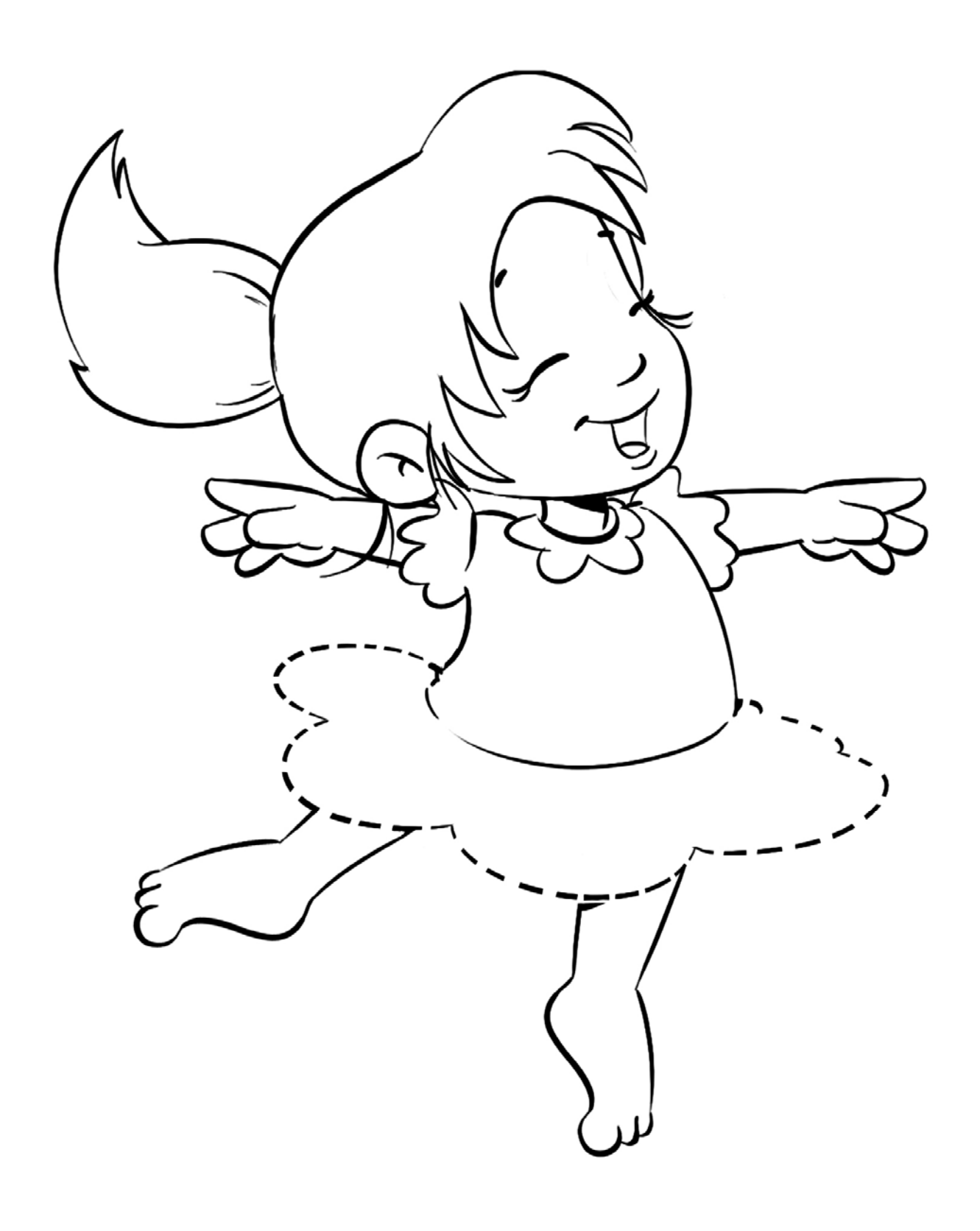
Unit 4: Complete the picture.