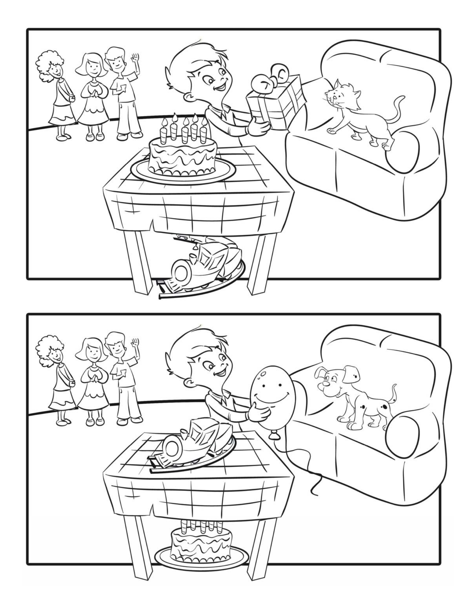
Unit 3: Find four differences.