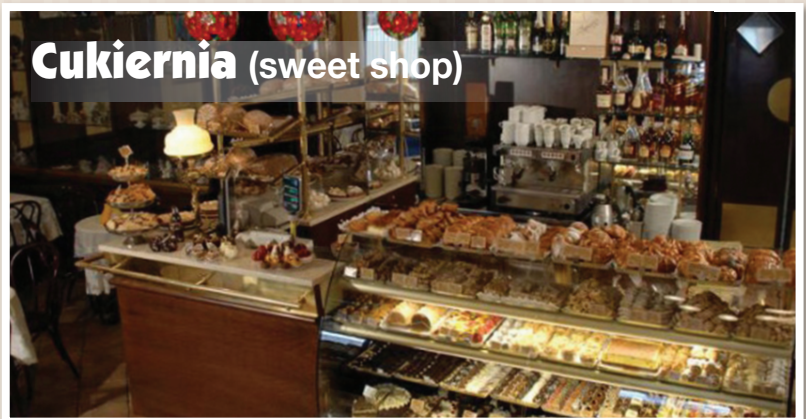
Cukiernia (sweet shop)

Lviv is known as Ukraine's coffee capital. Countless must-visit themed cafés invite you to enjoy a cup of rich, aromatic coffee in a charming atmosphere and learn something interesting about the city's history and culture.